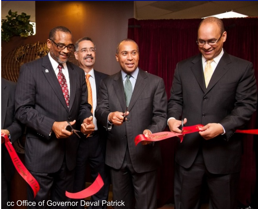
cc Office of Governor Deval Patrick