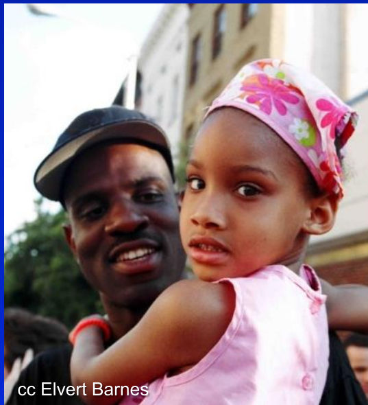
cc Elvert Barnes